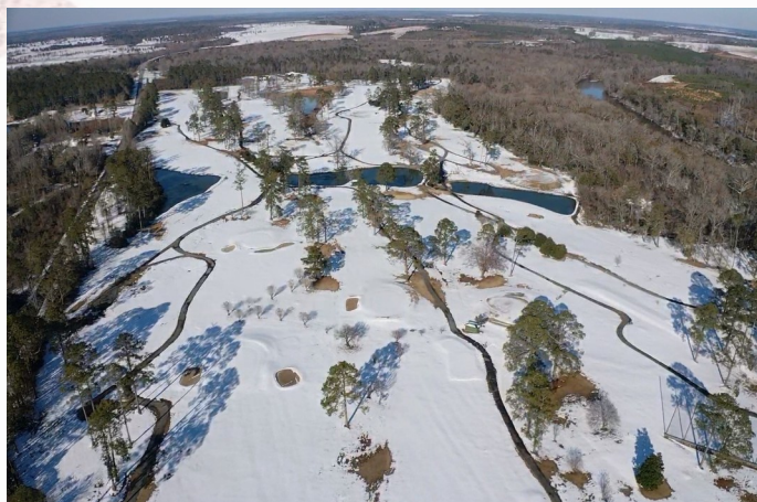
Snow Day January 2025—Dublin Country Club Golf Course

Golf Shop – Is pleased to report that brand new Titleist GT Drivers and fairway woods are now in stock. We also have demos that you can hit at your leisure. Titleist is using materials never used before to give you exceptional